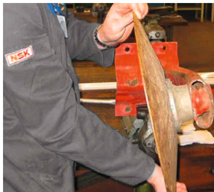
An NSK employee removing the unit from the machine arm.