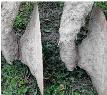
Typical picture of a compact disc harrow covered in dirt following the use of liquid manure.